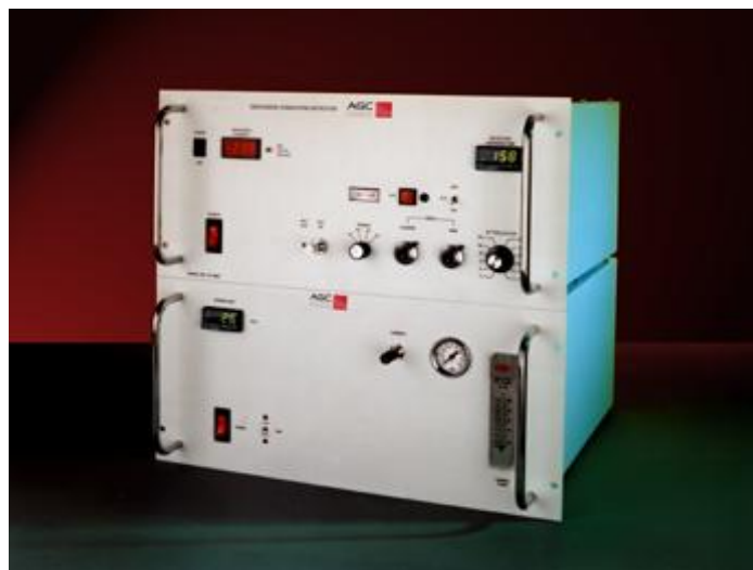
High Frequency Argon Discharge Detector (HFADD)